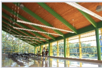
The cafeteria at the new Monocacy Elementary typifies the bright and airy design of the school.

"I sort of like the color yellow, and it's all over the school," the second-grader said.